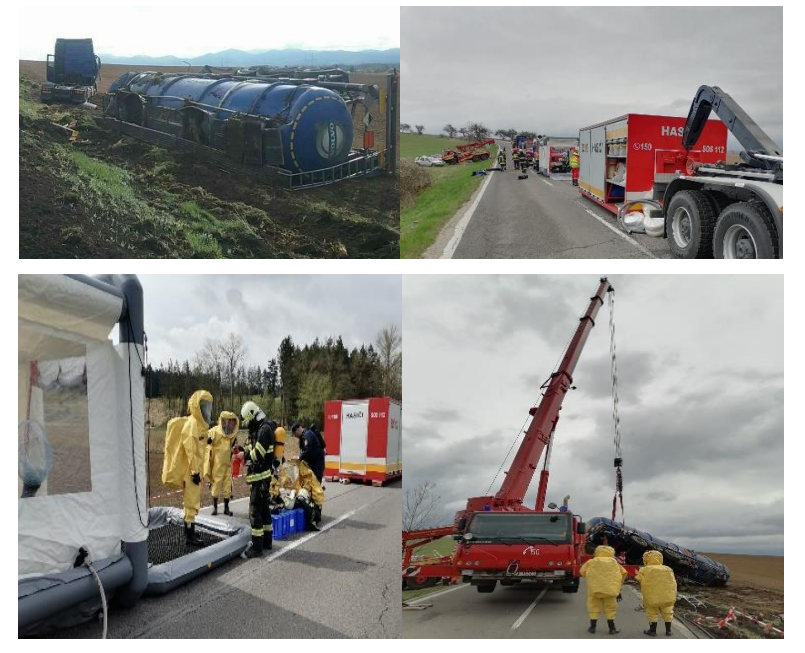
Fig. 1. Progress of rescue operations by fire brigades

After arriving at the scene of the reported traffic accident, the incident commander conducted a survey and the fire brigade determined the direction of the wind, marked the scene of the incident and determined the technical condition of the tank. As a result of the traffic accident, AD Blue leaked from the vehicle. A petroleum product sealant was used to prevent further leakage. The truck driver provided the incident commander with the documents necessary to transport dangerous substances (Figure 1). Due to the fact that the tank was significantly deformed and there was a risk of leakage of the transporting hydrochloric acid, the commander of the intervention called in additional forces and resources for the intervention. Transfer of the transported dangerous substance was required. Firefighters developed two high-pressure jets, which were used to cool the crashed tanker. They developed the hose line from the MB Vario, which was used to provide water for the decontamination shower. Workers of the transport company brought an empty tank to replace the crashed tank and prepared equipment for pumping out the dangerous substance. A control staff, a decontamination workplace with a decontamination shower, as well as a place for providing first aid to the responding firefighters were set up at the site of the intervention [5-7].